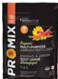
PRO-MIX® Organic Multi-Purpose 7-3-3