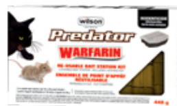
WILSON® PREDATOR® WARFARIN™ Re-usable Mouse Bait Station Kit CODE: 7 70552 0 SIZE: 1 kit