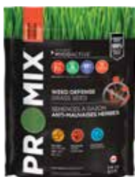
PRO-MIX® Weed Defense