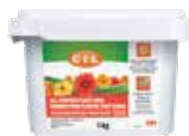
C-I-L® All Purpose Plant Food 20-20-20