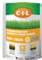
C-I-L® Premium Sun Grass Seed