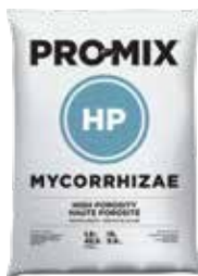
PRO-MIX® HP Mycorrhizae™

CODE/SIZE: 4 92015 1 (42.5 L), 4 92038 1 (3.8 cu. ft.)