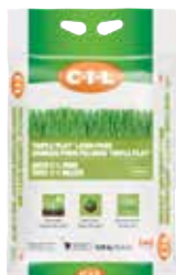
C-I-L® Triple Play™ Lawn Food 33-0-3