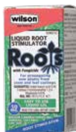
WILSON® ROOTS® Liquid Stimulator CODE: 7 90684 2 SIZE: 50 ml