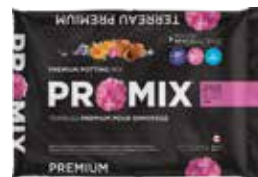
PRO-MIX® Potting Mix

CODE/SIZE: 4 98140 1 (28.3 L), 4 98170 1 (2 cu. ft.)