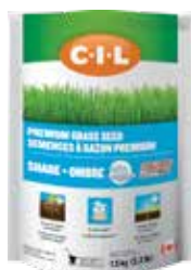
C-I-L® Premium Shade Grass Seed