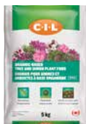
C-I-L® Organic-based Tree and Shrub Plant Food 18-8-8