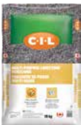
C-I-L® Multi-Purpose Limestone Screening