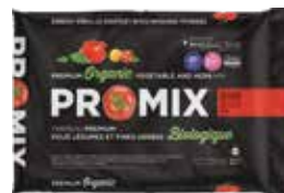
PRO-MIX® Organic Vegetable and Herb Mix

CODE/SIZE: 4 98140 1 (28.3 L), 4 98170 1 (2 cu. ft.)