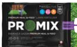
PRO-MIX® Heal & Feed™ Lawn Fertilizer 20-0-5