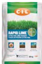
C-I-L® Rapid Lime®