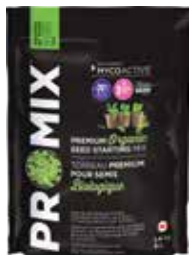
PRO-MIX® Organic Seed Starting Mix