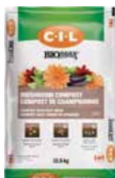
C-I-L® BIOMAX™ Mushroom Compost