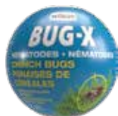
WILSON® BUG-X® Chinch Nematodes