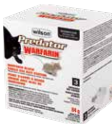
WILSON® PREDATOR® WARFARIN™ Mouse Bait Station CODE/SIZE: 7 70554 0 (3 stations)