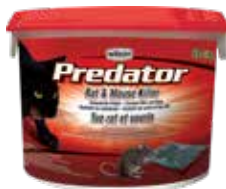
WILSON® PREDATOR® Rat & Mouse Pellets CODE/SIZE: 7 74011 0 (360 g), 7 74012 0 (720 g)