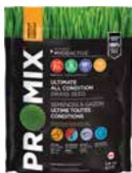
PRO-MIX® Ultimate All Condition