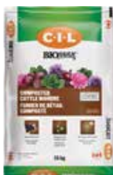
C-I-L® BIOMAX™ Composted Cattle Manure