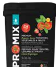
PRO-MIX® Organic-based Tomatoes, Vegetables & Fruits 9-16-16