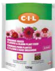
C-I-L® Organic-based Flower & Bloom Plant Food 6-14-8