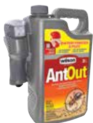
WILSON® AntOut® Battery powered