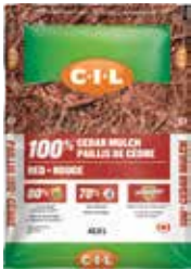
C-I-L® 100% Red Cedar Mulch