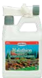
WILSON® Malathion Insecticide Attach & Spray