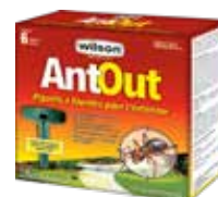
WILSON® AntOut® Outdoor Ant Stakes