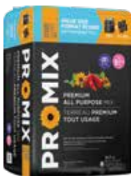
PRO-MIX® All Purpose Mix