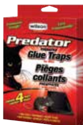
WILSON® PREDATOR® Mice Glue Traps