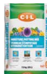
C-I-L® Moisture Potting Mix