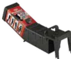
WILSON® PREDATOR® TIP TRAP™