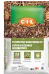
C-I-L® Decorative Bark Nuggets