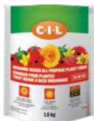
C-I-L® Organic-based All Purpose Plant Food 10-10-10