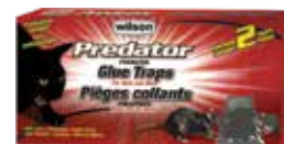
WILSON® PREDATOR® Rats and Mice Glue Traps