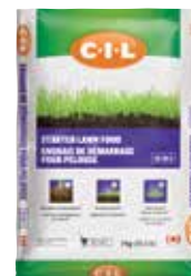
C-I-L® Starter Lawn Food 10-20-5