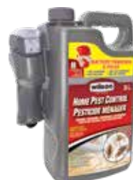
WILSON® Home Pest Control Battery powered