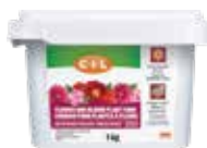
C-I-L® Flower and Bloom Plant Food 15-30-15