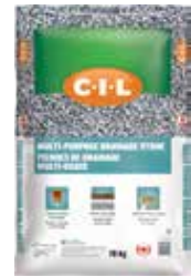
C-I-L® Multi-Purpose Drainage Stone