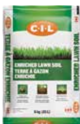
C-I-L® Enriched Lawn Soil

CODE/SIZE: 2 80756 1 (15 L), 2 80757 1 (25 L)