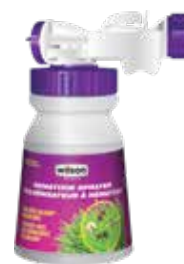
WILSON® Nematode Sprayer