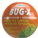
WILSON® BUG-X® Leatherjacket Nematodes