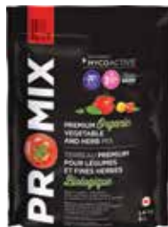
PRO-MIX® Organic Vegetable and Herb Mix

CODE/SIZE: 4 98012 0 (5 L), 4 98011 0 (9 L)