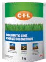
C-I-L® Dolomitic Lime