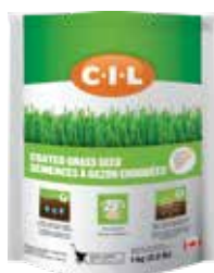
C-I-L® Coated Grass Seed

CODE/SIZE: 2 33859 0 (1 kg), 2 33846 1 (10 kg), 2 33847 1 (25 kg)