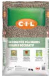
C-I-L® Decorative Pea Gravel