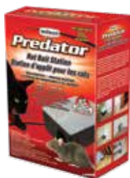
WILSON® PREDATOR® Rat Bait Station CODE: 7 74105 0 SIZE: 1 station