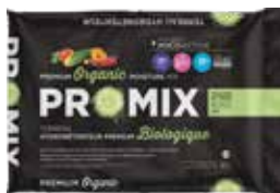
PRO-MIX® Organic Moisture Mix