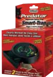
WILSON® PREDATOR® Smart-Trap™ CODE: 7 74049 0 SIZE: 2 traps