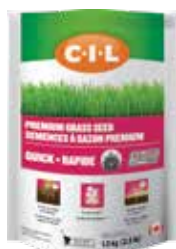
C-I-L® Premium Quick Grass Seed

CODE/SIZE: 2 33801 0 (1.5 kg), 2 33802 0 (4 kg)