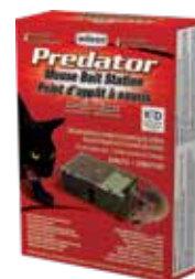
WILSON® PREDATOR® Mouse Bait Station CODE/SIZE: 7 74006 0 (1 station), 7 74007 0 (4 stations)