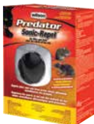
WILSON® PREDATOR® Sonic-Repel™