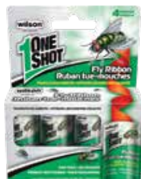
WILSON® ONE SHOT® Fly Ribbon