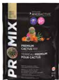
PRO-MIX® Cactus Mix