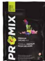
PRO-MIX® Orchid Mix

CODE/SIZE: 4 98092 0 (5 L), 4 98091 0 (9 L)