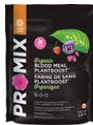
PRO-MIX® Organic Blood Meal PlantBoost™ 8-0-0