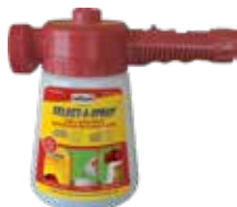
WILSON® SELECT-A- SPRAY® Lawn & Garden Sprayer