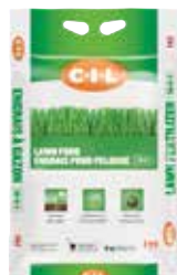
C-I-L® Lawn Food 30-0-3

2 31540 1 (5.25 kg), 2 31541 1 (10.5 kg)