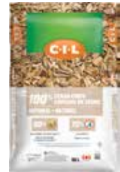
C-I-L® 100% Natural Cedar Chips