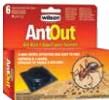
WILSON® AntOut® Ant Bait