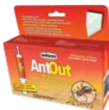
WILSON® AntOut® Ant Bait Gel