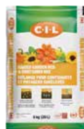
C-I-L® Raised Garden Bed & Container Mix