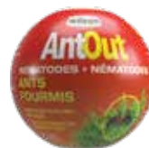
WILSON® AntOut® Nematodes