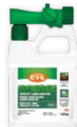
C-I-L® Liquid Lawn Food 30-0-0