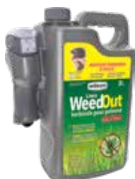
WILSON® Lawn WeedOut® Ultra™ Battery powered