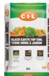
C-I-L® Black Earth Top Soil