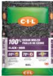
C-I-L® 100% Black Cedar Mulch