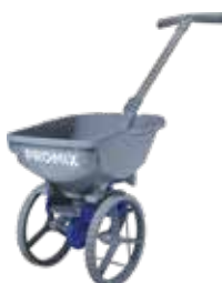
PRO-MIX® Premium Spreader