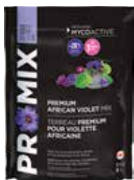
PRO-MIX® African Violet Mix