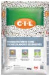
C-I-L® Decorative White Stone