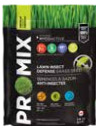
PRO-MIX® Lawn Insect Defense