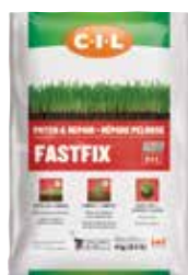
C-I-L® FASTFIX® Patch & Repair 9-1-1

CODE/SIZE: 2 33807 0 (1 kg), 2 33808 0 (2 kg)