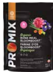
PRO-MIX® Organic Bone Meal BloomBoost™ 4-7-0