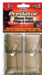
WILSON® PREDATOR® Wood Mouse Traps

CODE/SIZE: 7 74045 0 (2 traps), 7 74046 2 (12 traps)