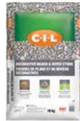
C-I-L® Decorative Beach & River Stone