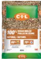
C-I-L® 100% Natural Cedar Mulch