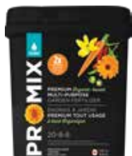
PRO-MIX® Organic-based Multi-Purpose 20-8-8