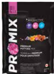
PRO-MIX® Potting Mix

CODE/SIZE: 4 98012 0 (5 L), 4 98011 0 (9 L)