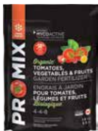
PRO-MIX® Organic Tomatoes, Vegetables & Fruits 4-4-8