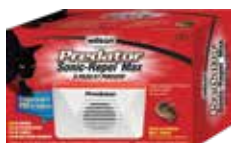
WILSON® PREDATOR® Sonic-Repel™ Max Battery