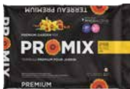
PRO-MIX® Garden Mix