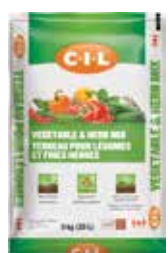
C-I-L® Vegetable & Herb Mix