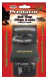
WILSON® PREDATOR® Fast Set Rat Trap