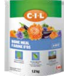
C-I-L® Bone Meal 4-10-0