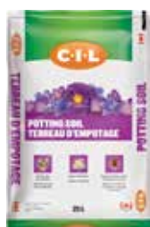
C-I-L® Potting Soil

CODE/SIZE: 2 80756 1 (15 L), 2 80757 1 (25 L)