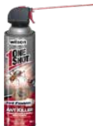
WILSON® ONE SHOT® Jet Foam Ant Killer