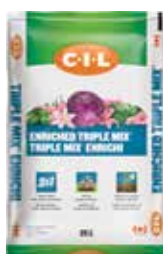
C-I-L® Enriched Triple Mix®