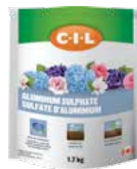
C-I-L® Aluminum Sulphate