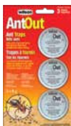
WILSON® AntOut® Ant Traps – 3 Pack