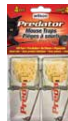
WILSON® PREDATOR® Wood Mouse Traps with Plastic Cheese

CODE/SIZE: 7 74045 0 (2 traps), 7 74046 2 (12 traps)