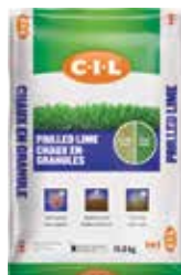
C-I-L® Prilled Lime