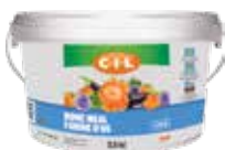
C-I-L® Bone Meal 4-10-0