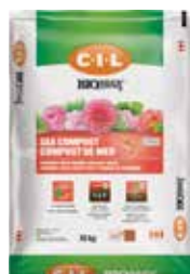
C-I-L® BIOMAX™ Sea Compost