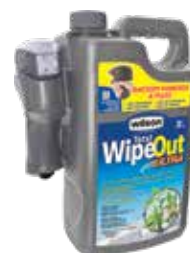
WILSON® Total WipeOut® Ultra™ Battery powered