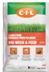
C-I-L® BIO-WEED & FEED™ 9-0-0