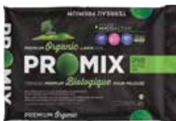
PRO-MIX® Organic Lawn Soil