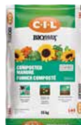
C-I-L® BIOMAX™ Composted Manure