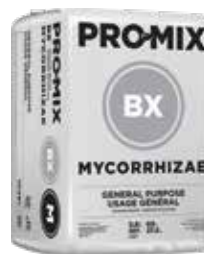
PRO-MIX® BX Mycorrhizae™

CODE/SIZE: 4 92015 1 (42.5 L), 4 92038 1 (3.8 cu. ft.)