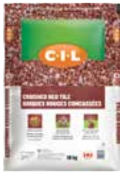
C-I-L® Crushed Red Tile