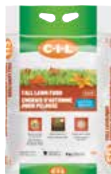
C-I-L® Fall Lawn Food 12-0-18