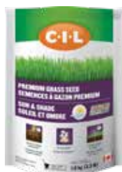
C-I-L® Premium Sun & Shade Grass Seed

CODE/SIZE: 2 33801 0 (1.5 kg), 2 33802 0 (4 kg)