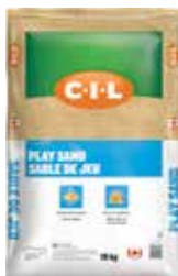
C-I-L® Play Sand