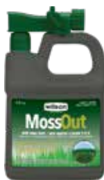
WILSON® MOSSOUT® with Lawn Food 5-0-0 CODE/SIZE: 7 20209 0 (2.5 kg), 7 20210 2 (5 kg)