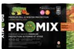
PRO-MIX® Fall & Winter Protection Lawn Fertilizer 10-0-32