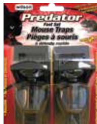
WILSON® PREDATOR® Fast Set Mouse Traps