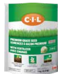
C-I-L® Premium Grass Seed & Fertilizer 02-05-02

CODE/SIZE: 2 33807 0 (1 kg), 2 33808 0 (2 kg)