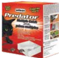
WILSON® PREDATOR® Multiple Catch Mouse Trap CODE: 7 74035 0 SIZE: 1 trap