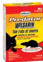
WILSON® PREDATOR® WILSARIN® Rat & Mouse Killer CODE/SIZE: 7 70587 0 (360 g), 7 70588 0 (900 g)