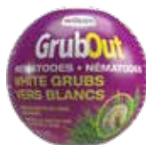
WILSON® GrubOut® Nematodes