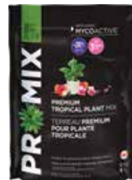
PRO-MIX® Tropical Plant Mix

CODE/SIZE: 4 98092 0 (5 L), 4 98091 0 (9 L)